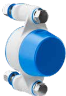
2-HOLE FLANGE XB2FC