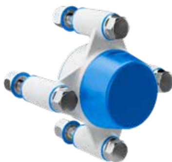
4-HOLE FLANGE XB4FC