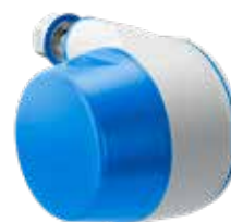
TAPPED BASE XBTBC