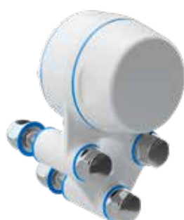
3-HOLE FLANGE XB3FC